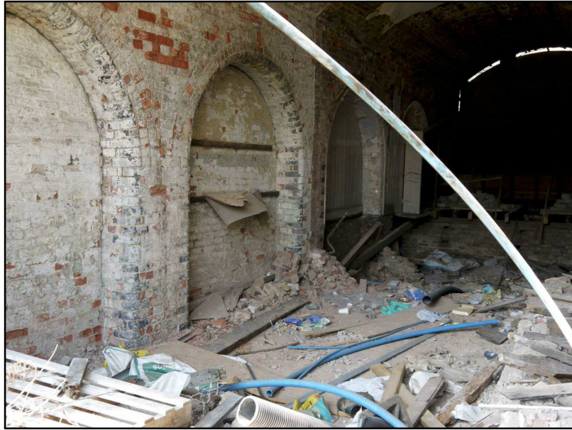
VIEW OF VAULTS CONTAINING CROSS ARCHES Vaults to be opened up and cleared of rubble to enable existing cross arches to be surveyed.